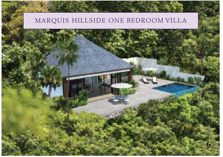
MARQUIS HILLSIDE ONE BEDROOM VILLA