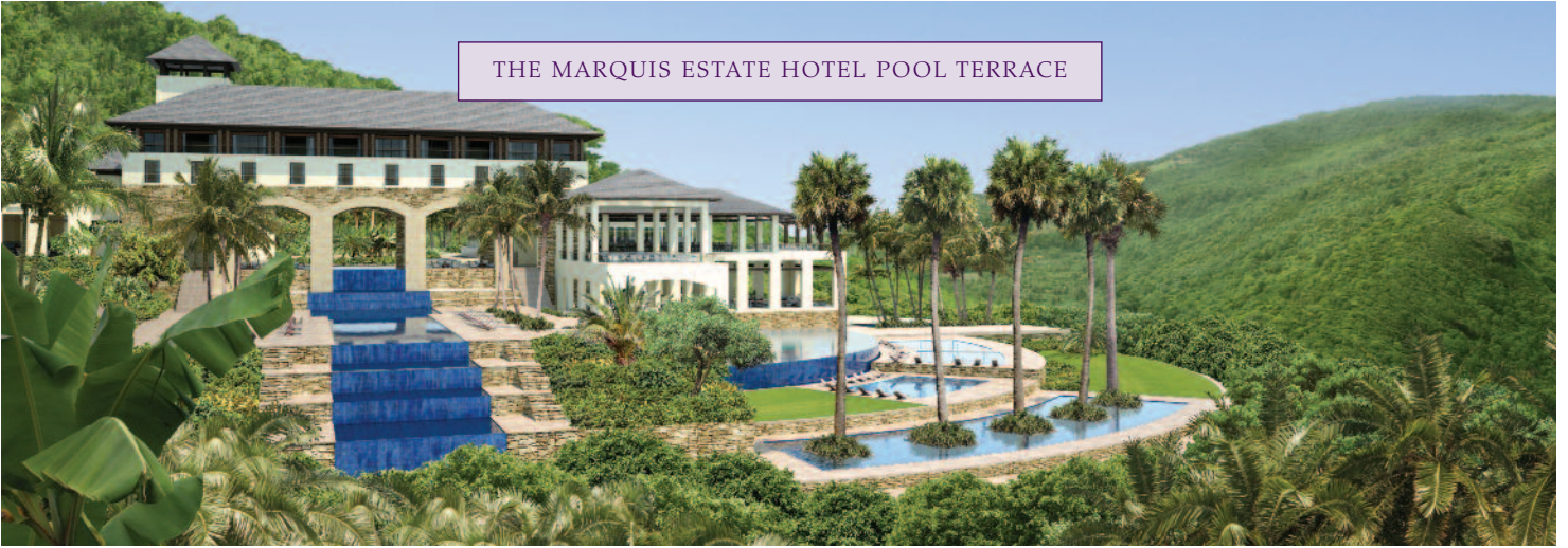
THE MARQUIS ESTATE HOTEL POOL TERRACE