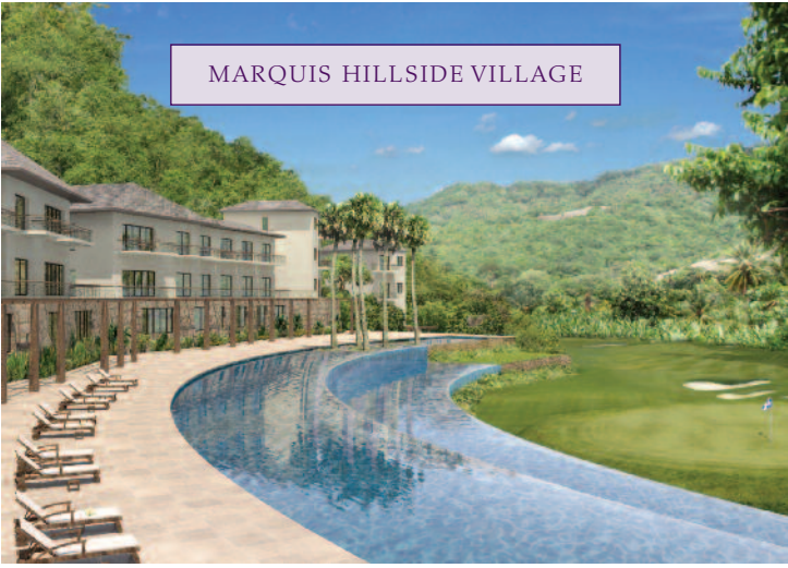
MARQUIS HILLSIDE VILLAGE