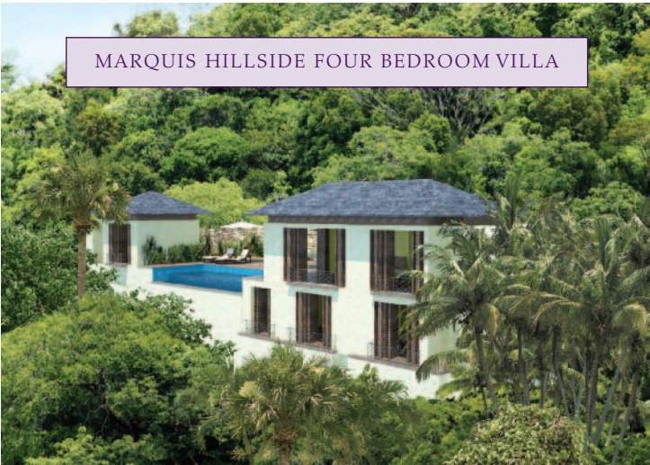
MARQUIS HILLSIDE FOUR BEDROOM VILLA