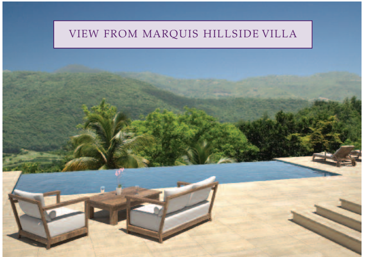
VIEW FROM MARQUIS HILLSIDE VILLA